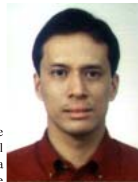
(Philippine General Hospital, a tertiary-care