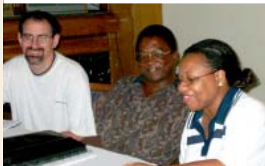
AfricaCLEN members at work

conducting research. Some of the reasons cited included lack of adequate funds to conduct, present, and publish research. Repackaging of research proposals to suit donor requirements was suggested to be often necessary in order to attract funding. There is a need for CEUs to complete proposals in different research and capacity building fields so as to meet deadlines when announcements for grants arise. Most important is the need for individual and CEU commitment to the mission of INCLLEN-Africa, where each party fulfills its role to sustain a team spirit.