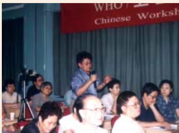
ChinaCLEN LAMP workshop