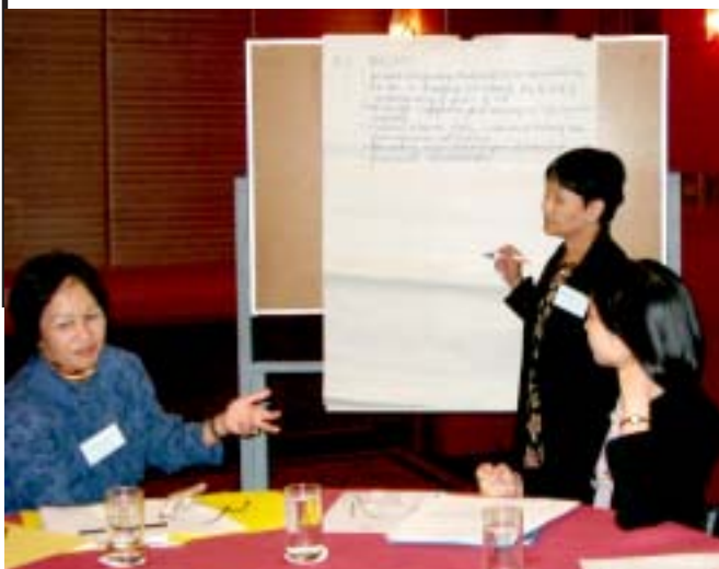
INCLIN-SEA members at work